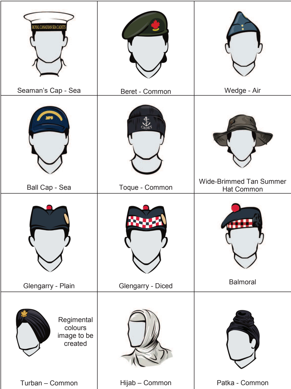
Figure 2-2-F – Headdress